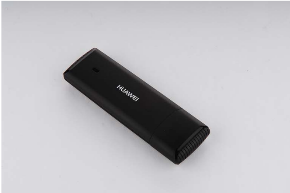
Figure 1-1 E1750 profile

Figure 1-1 shows the profile of the E1750.