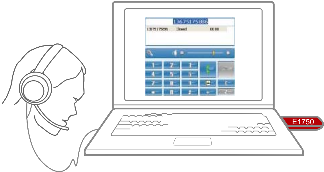
Figure 3-1 Voice service interface

Figure 3-1 shows the voice service interface.